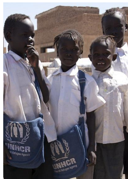
South Sudanese students presenting for registration at Soba Kongor open area, Khartoum. UNHCR/N. Brass, 2 February 2015

As of 4 th February 2,820 South Sudanese individuals have been registered in Khartoum State. The exercise will first be completed in Khartoum before being rolled out across the rest of the country.