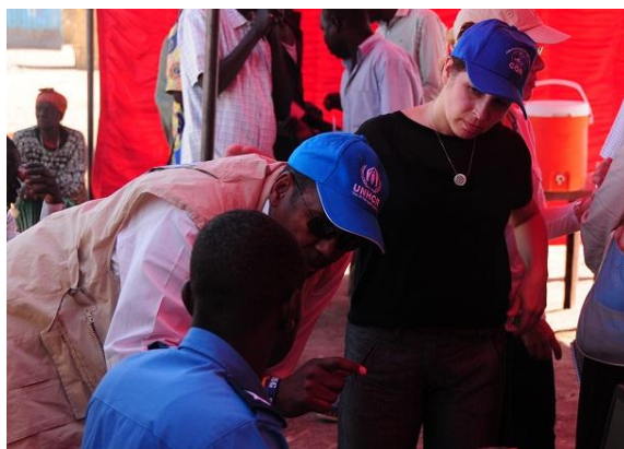
UNHCR staff attending the joint registration at Soba Kongor open area, Khartoum.

According to the Memorandum of Understanding, the DPI will undertake the registration of South Sudanese in Sudan and provide them with identity cards, which will be a legally recognized proof of identity, granting them the rights to stay, work and move freely in Sudan, as well as access to civil status documents and other public services available to Sudanese citizens.