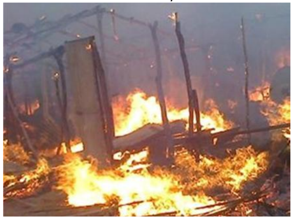
The fire that destroyed homes and affected more than 700 individuals in Aweil.

In Rumbek County, WHO co-facilitated at a three-day training workshop on Communication for Development training for 131 participants comprising community volunteers and supervisors. WHO focused on community surveillance of AFP, AJS, measles and Guinea Worm Disease (GWD).