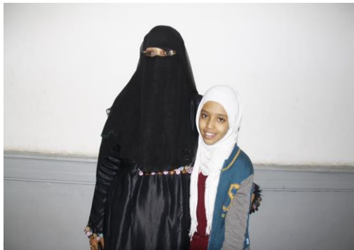
A Yemeni refugee and her 13-year-old daughter in Addis Ababa, Ethiopia