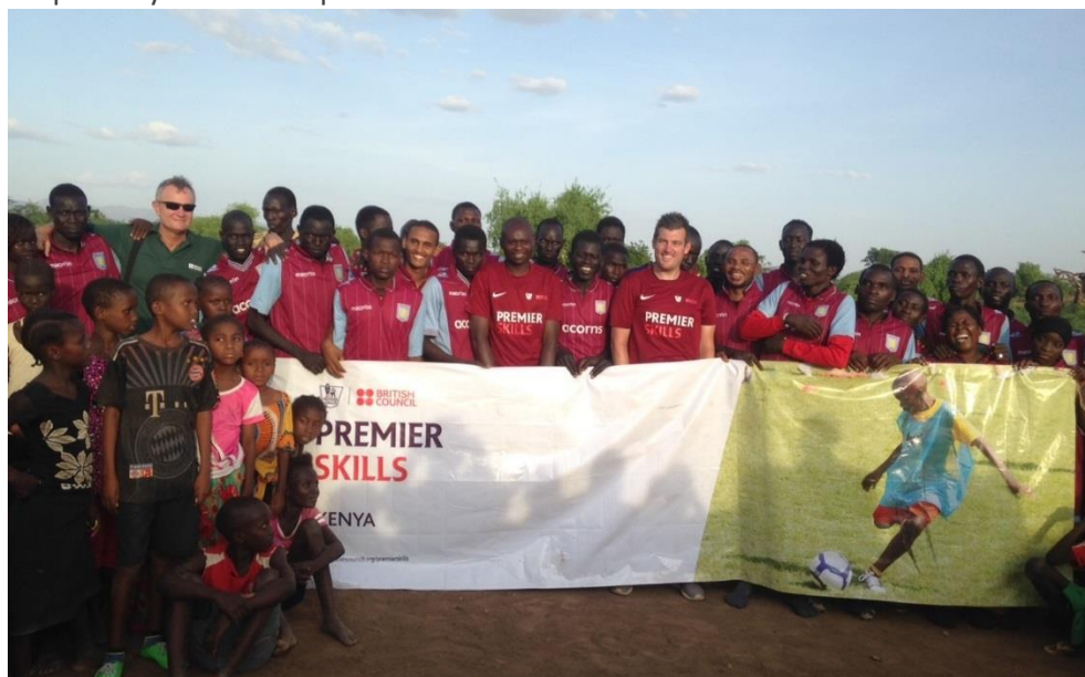
Coaches and players who participated in the Premier Skills training pose with British Council Director (back left) and Premier Skills lead coach (center)