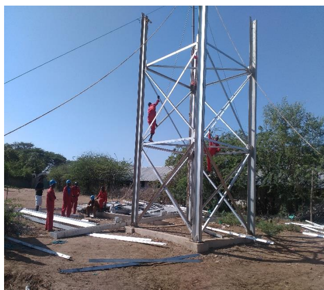
Workers constructing an elevated water tank in the camp.