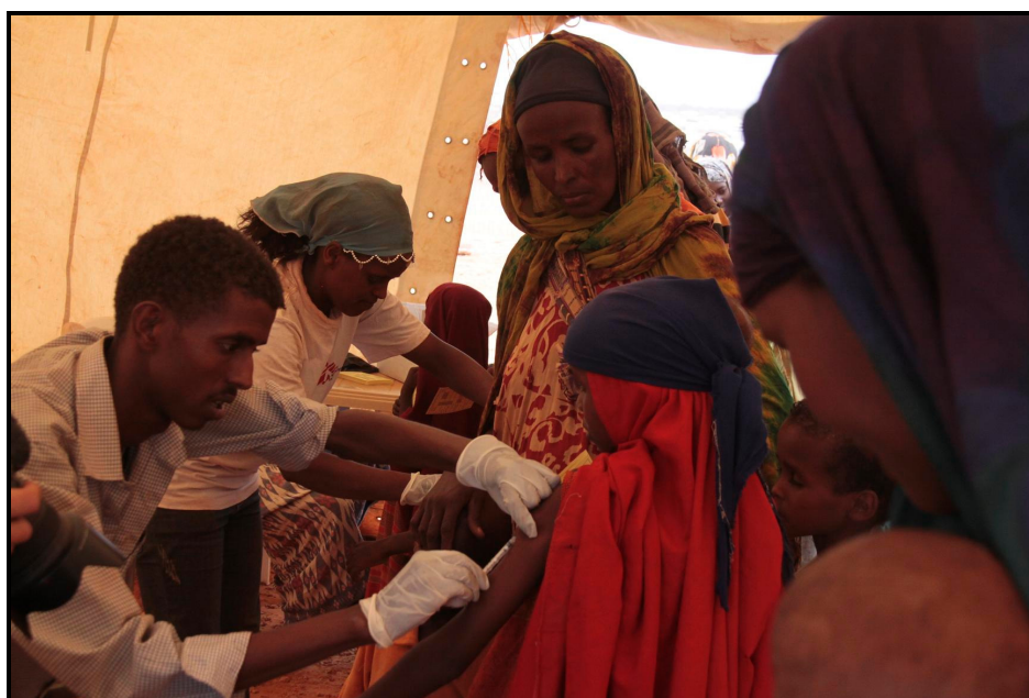
Immunisation of all children under 15 gets underway in Kobe camp in the Dollo Ado area