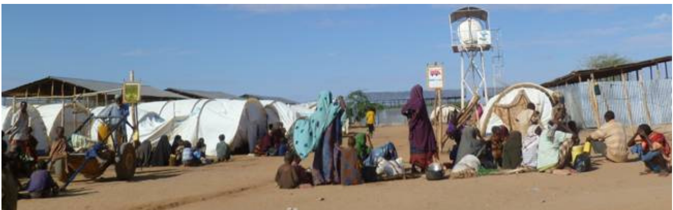
Vulnerable asylum seekers arrive at the reception centre waiting to be registered for movement

Movements – As of 23 October 2011, IOM had provided transport assistance to 33,100 refugees from the Reception Centre in Dollo Ado to the Transit Centre and from the Transit Centre to Hilaweyn Camp. Heavy rains in Dollo Ado have led to a significant decrease in the number of new arrivals registered at the Reception Centre. 1,026 refugees reported to the Reception Centre between 17-24 October as compared to 3,253 refugees registered between 10-16 October. The rains have also made the roads impassable and hampered humanitarian work in the region.