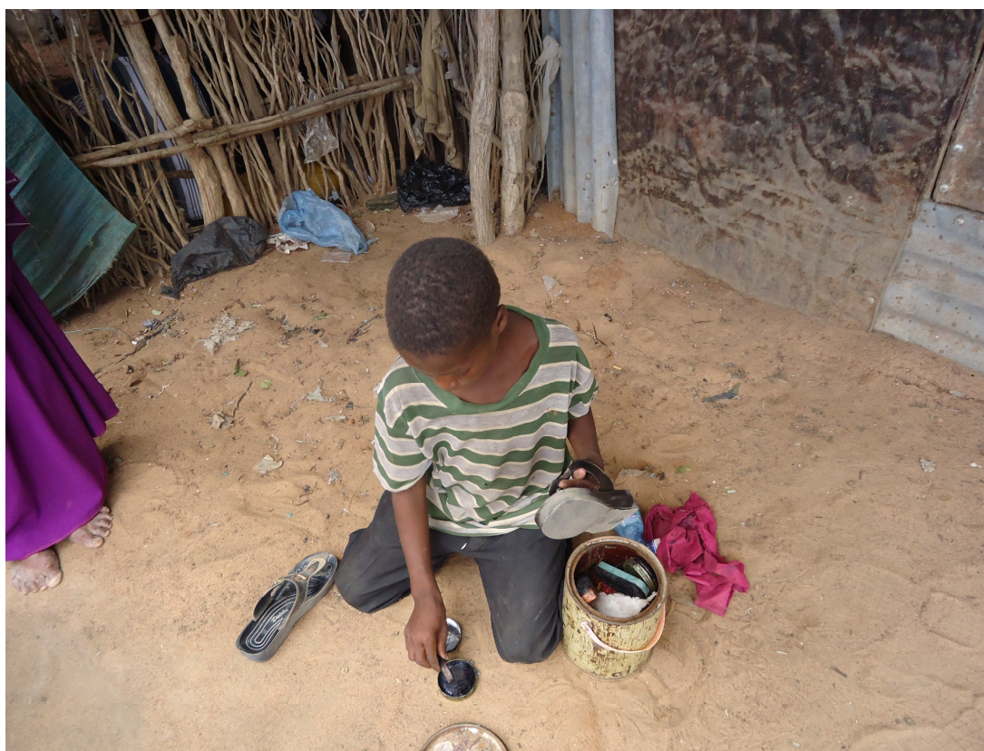
Child labour in the camps: Shoeshine boy

In Kambioos an education enrolment campaign was conducted to encourage parents to enrol their children in school in 2014. The campaign targeted mostly the Somali Bantu community where most children do not go to school and are engaged in child labour. Community representatives requested to be incorporated in the school management committees and also be recruited as teachers. They cited discrimination and harassment of children while walking to school as well as lack of livelihood as their major challenges.