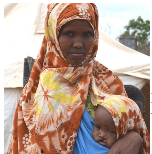
Mother and young child in Ifo 2