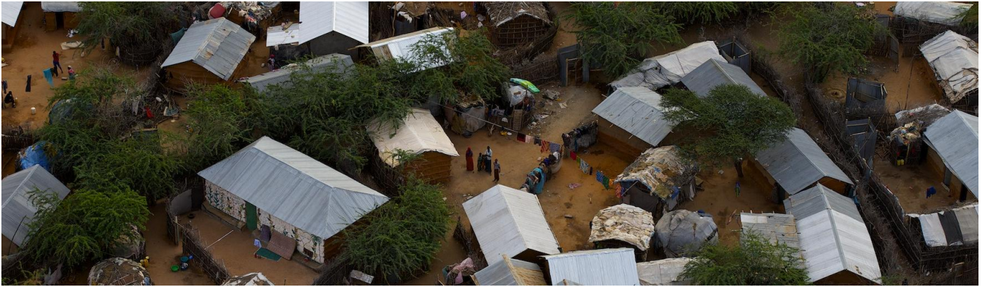
Houses in Dagahaley