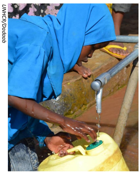
Water stand in Ifo 2