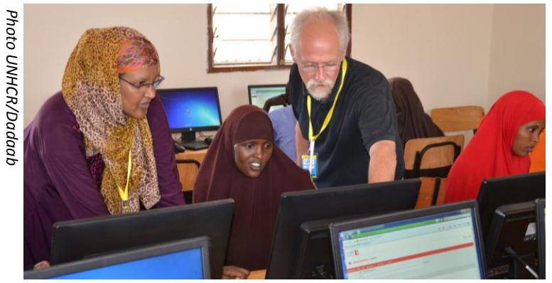
Teachers and students at Kenyatta University in Dadaab town

In the frameworks of 'Borderless Higher Education for Refugees', 150 refugees and members of the host community