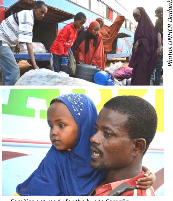
Families get ready for the bus to Somalia