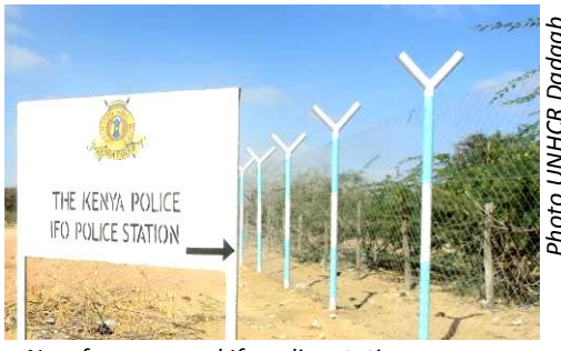
New fence around Ifo police station

In order to improve access to legal assistance for refugees and host community, UNHCR is planning to build a permanent court facility. A wall fence is under construction to secure the site and a water supply system is being prepared. Until the court building is finished, UNHCR continues to support mobile courts in the Dadaab camps.