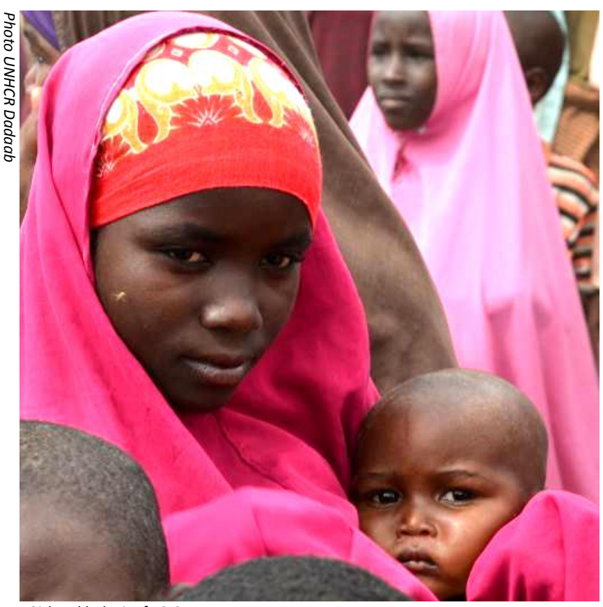
The data collection carried out in Dadaab in 2014 built on previous studies conducted in other locations. The research results add to the growing evidence base on scope and severity of IPV in humanitarian settings.

UNHCR in collaboration with International Rescue Committee (IRC) organized a workshop to discuss the preliminary findings from the Intimate Partner Violence (IPV) Research. Violence against women and girls perpetrated by their intimate partners is a global phenomenon and prevalence is likely to be even higher in humanitarian settings.