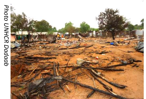
Hagadera section D 3 after the fire

On 22<sup>nd</sup> January, a fire was contained by residents of Hagadera camp and by Kenya Red Cross Society