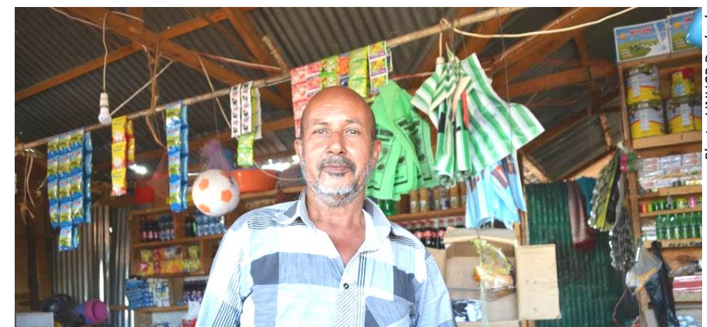
One of the few shop owners in Kambioos camp

Currently, there are only few shops in Kambioos camp and refugees travel over 6km to Hagadera camp to buy essential commodities.