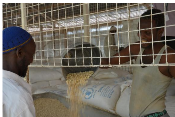
Food distribution in Ifo refugee camp.