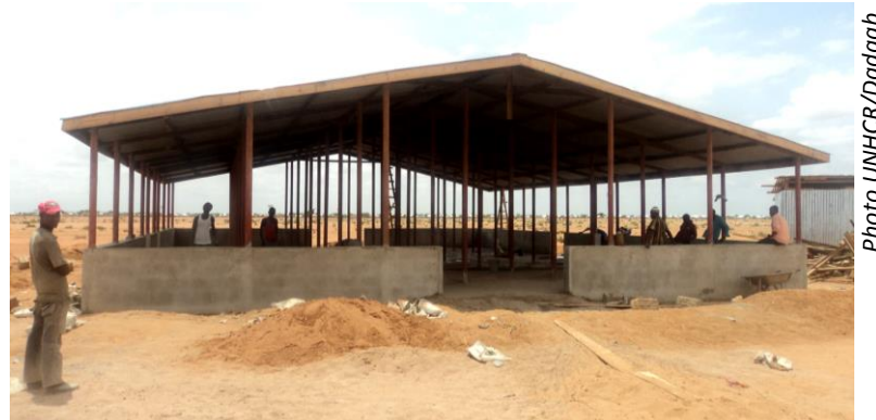
Market stalls under construction in Ifo 2 camp

The construction of the new market in Ifo 2 camp is proceeding. The camp residents have so far been travelling long distances to Ifo and Dagahaley camps to access basic household commodities. The new market is expected to improve livelihood opportunities for the population in Ifo 2.