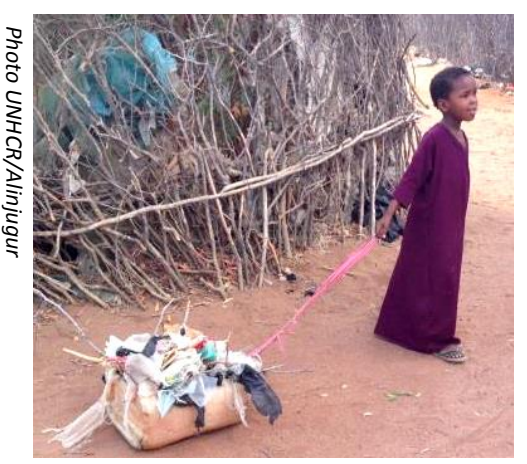
All age groups participated in the clean-up campaigns