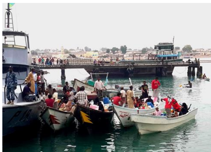
Boats with Yemeni refugees arriving at the port of Obock, in the north of Djibouti. Some of the new arrivals came from Bab al Mandeb, a fishing village in Yemen. They left Yemen with their own boats. 2015