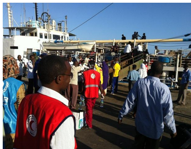
UNHCR and partners greet new arrivals at the port in Berbera, Somaliland. After receiving medical treatment and other immediate needs, registration is provided for those requesting UNHCR assistance at the reception centre. May 2015

Somalia: As of 19 May 2015, and with the arrival of a boat from Mukalla port in Yemen to Bossaso port in Puntland, carrying 234 individuals (229 Somalis and five Yemenis), there are now 7,278 arrivals to Somalia since the onset of the crisis at the end of March.