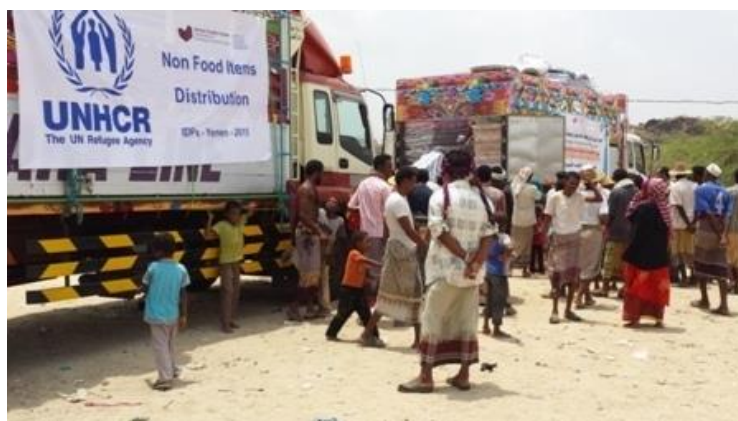
Distributions of emergency relief items in Al-Qa'is district, Hajjah Governorate provided 88 families with plastic sheeting, kitchen sets, buckets, mattresses, blankets and mats. 15 May 2015