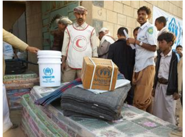
NFIs distribution in Amran city with UNHCR's partner Yemen Red Crescent; 184 families (1,495 individuals) received emergency aid.