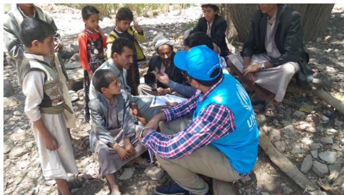
UNHCR staff conducting rapid protection assessments during the humanitarian pause with the community in Bani Hushaish, Sana'a

The three-day conference in Riyadh entitled “Saving Yemen and Building a Federal State” took place from 17 to 19 May. The conference hosted 400 delegates from Yemeni political parties without the presence of the Al Houthis. The UN Special Envoy to the Secretary General for Yemen, Mr. Ismail Ould Cheikh Ahmed, called for an extension of the humanitarian pause and for the creation of conditions for a permanent ceasefire. He also appealed to all parties involved in the conflict to facilitate humanitarian access and emphasized that there would be no solution to the current crisis without inclusive negotiations. However, hostilities resumed after the five-day humanitarian pause, which officially ended at 11pm on 17 May. The conference concluded by adopting the Riyadh Declaration that calls for humanitarian action to end the suffering of the Yemenis (including IDPs), refugees, and stranded citizens abroad.