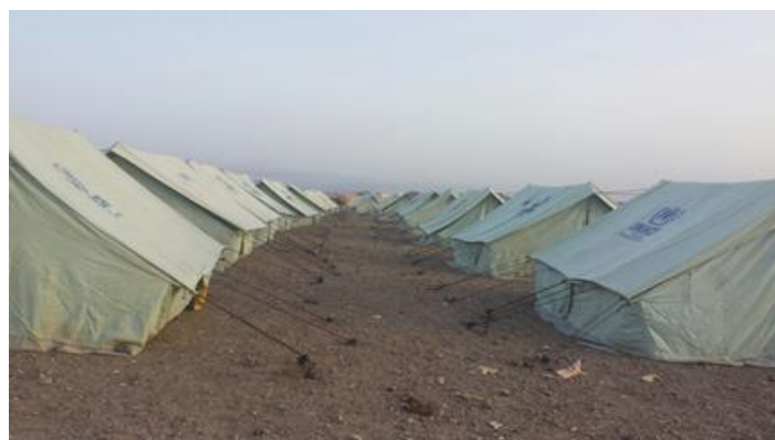
Society for Humanitarian Solidarity (SHS) sets up additional tents in the Kharaz camp to receive refugees displaced from urban areas inside Aden to the camp. 17 May 2015