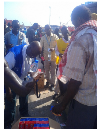
UNHCR, IOM and other humanitarian partners provide water to new arrivals at Bossaso Port, Puntland, on 6 June 2015

Onward transportation assistance: Between 4 and 8 June, UNHCR provided onward travel assistance to 337 Somali returnees (115 households) to enable them to return to their area of origin. In total, UNHCR has to date supported 1,154 individuals with onward transportation assistance. Cumulatively, the Puntland New Arrivals Task Force has assisted approximately 1,749 individuals to return to their areas of origin, primarily located in areas in South Central Somalia regions.