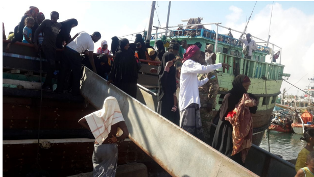
New arrivals disembark from boat Sultana , carrying 1,679 individuals fleeing Yemen, in Bossaso Port, Puntland, on 6 June 2015

A boat named Sultana , carrying 1,679 individuals (597 women, 439 men and 643 children), arrived on 6 June 2015 to the Port of Bossaso from Mukalla, Yemen. Among the new arrivals there were 63 Yemenis, 1 Ethiopian (recognized refugee in Yemen) and 1,615 Somali nationals.