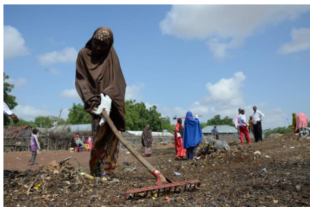
During second half of June, two mass cleanup campaigns were conducted in Kambioos and Hagadera camps.