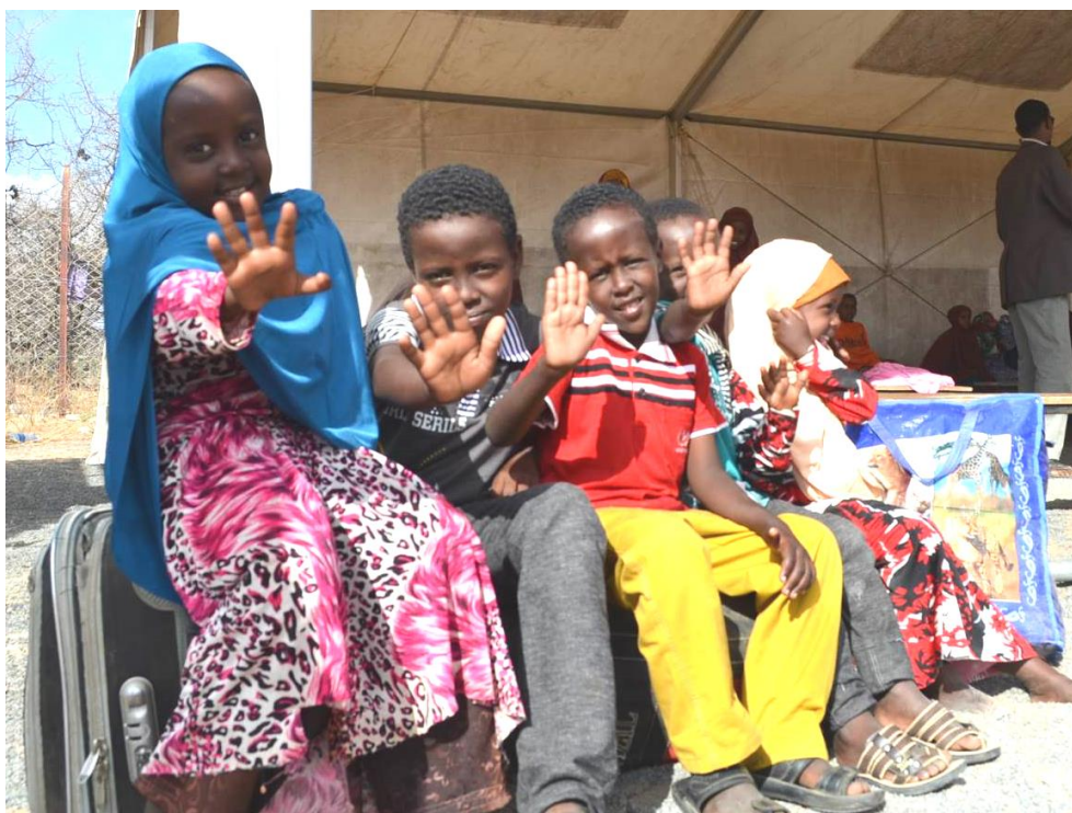
Group of siblings getting ready for return flight to Mogadishu at Dadaab airstrip