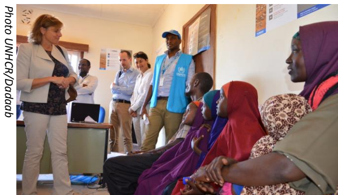
Minister Isabella Lövin chatting with refugees in Ifo 2 camp