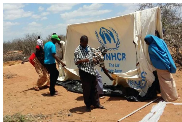
Tent pitching in Kambioos camp

to cover this gap, the most 363 vulnerable households will receive transitional shelters. Another 363 have already received tents. UNHCR and Department of Refugee Affairs (DRA) have also identified 50 beneficiaries to benefit from shelter repair kits. A shelter repair kit is composed of roofing materials including trusses and plane sheets.