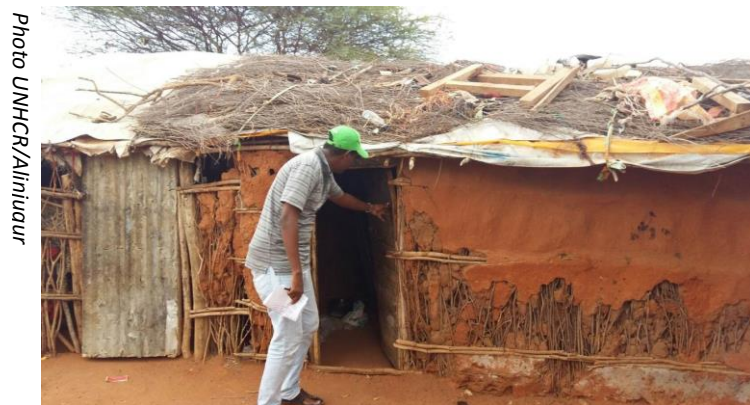
Makeshift shelter in Hagadera camp

to cover this gap, the most 363 vulnerable households will receive transitional shelters. Another 363 have already received tents. UNHCR and Department of Refugee Affairs (DRA) have also identified 50 beneficiaries to benefit from shelter repair kits. A shelter repair kit is composed of roofing materials including trusses and plane sheets.