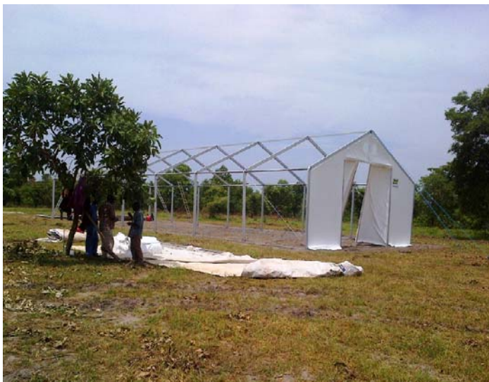
Photo 5. Set Up of Djako Temporary Site .

The first convoy transporting the first group of the 5000 Chadian Migrants is expected to leave Cameroun on the 22 and to arrive in Moundou around the 26 July 2014.