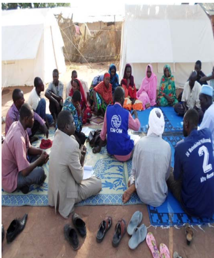
Photo 3. FGD during the UNCT and Government Assessment Mission on Peacebuilding in Southern Chad.

IOM has started transferring additional 1000 to 1100 CAR evacuees (250 households) from Doyaba and Sido to Maigama.