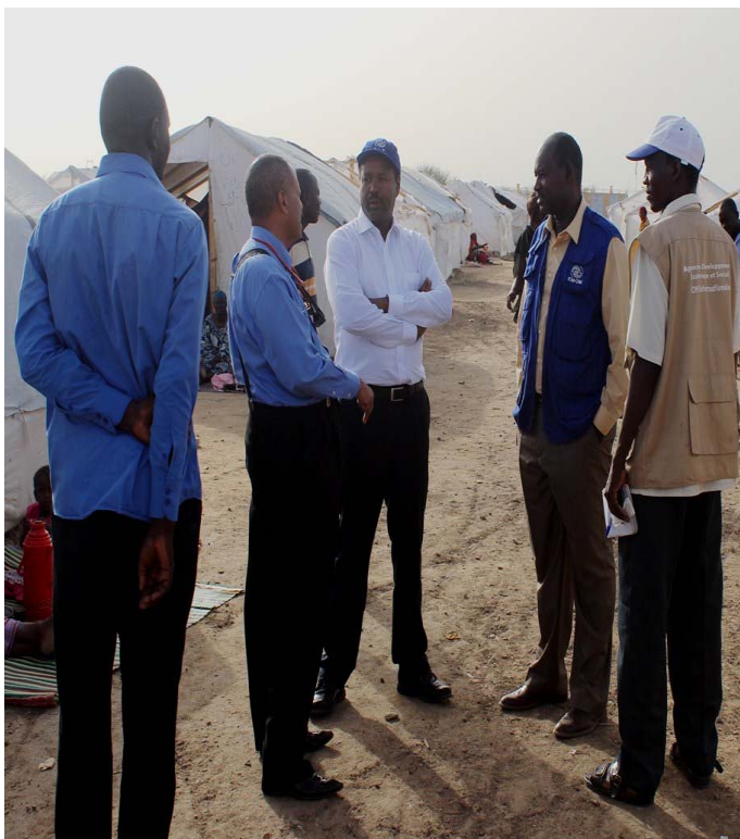
Photo 2. IOM DOE Director visiting Gaoui Temporary Site.

He also visited the Gaoui Transit Site in the outskirts of N'Djamena that is hosting some of the Returnees from CAR in Chad.