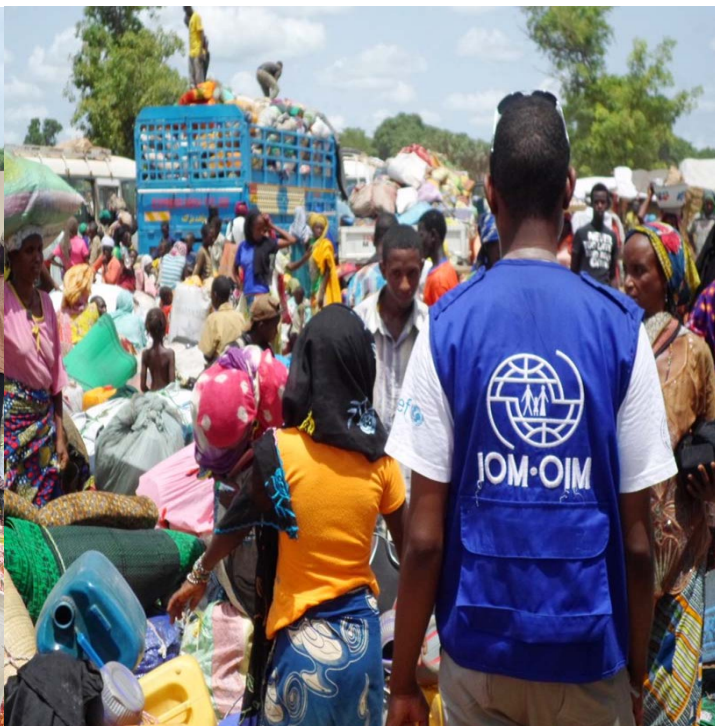
Photo 7. Relocation of Evacuees from Doyaba and Sido Transit Sites to Maigama Temporary Site.