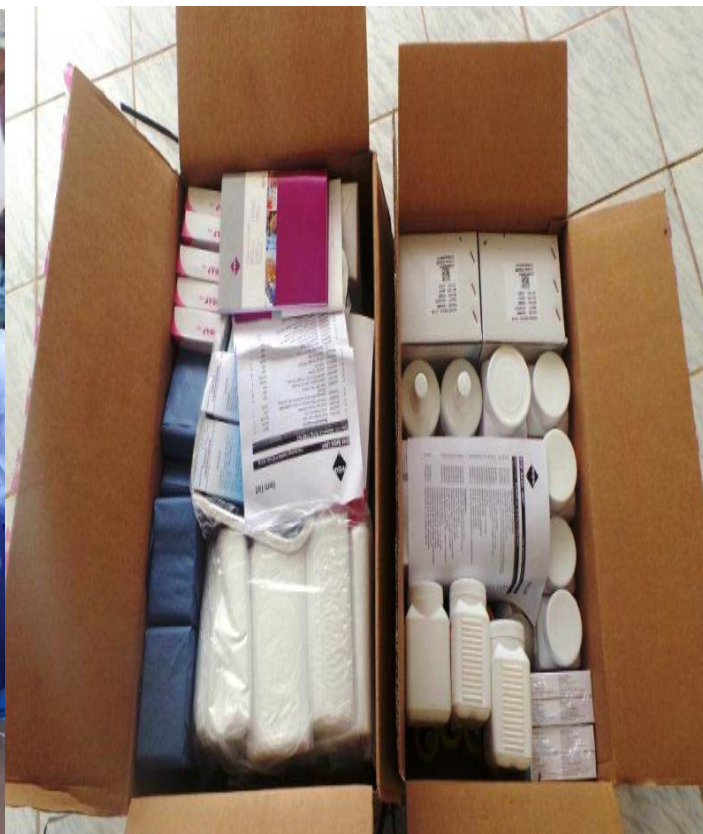
Photo 4. The Donation of Medical Supplies from World Health Organization to the IOM Temporary Clinic in Gaoui.