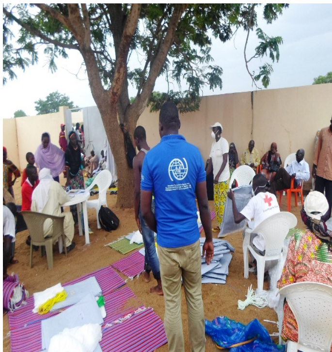
Photo 6. Distribution of Emergency Shelter Kits in Doyaba.