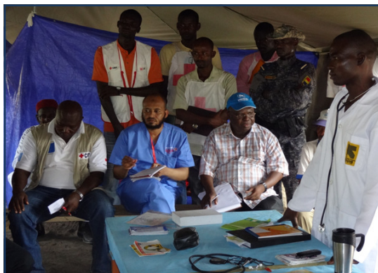
Left: Health Center operated by IRC Centre in Maigama. June 2014. Right: Family settled in a UNHCR tent in Danmadja, June 2014.

*Hosting villages: Koldaga, Bekourou, Dilin- gala & Doubadene