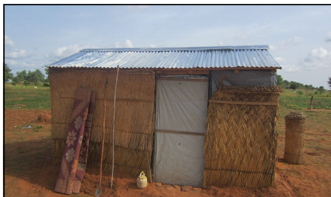
Right: Family shelter built by head of family in Kerfi, July 2014.