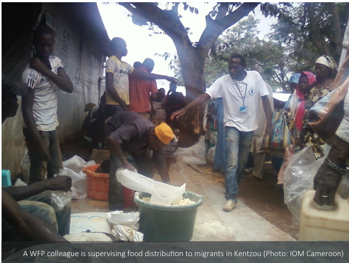
A WFP colleague is supervising food distribution to migrants in Kentzou