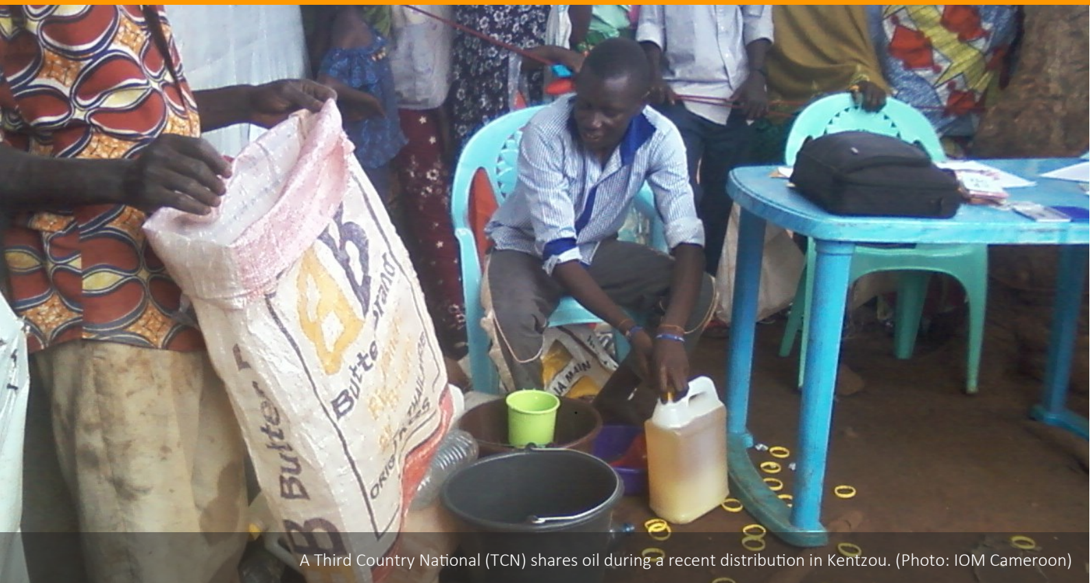
A Third Country National (TCN) shares oil during a recent distribution in Kentzou.