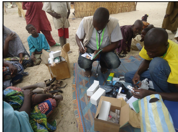
Right: UNHCR Partner in health, Centre de Support en Santé Internationale (CSSI), attending to Nigerian refugees.