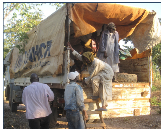
Left: Refugees prepare to board UNHCR trucks for relocation to Doholo; Right: arriving and disembarking in Doholo, Dec 2014.