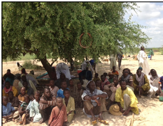
Left: Newly-arrived Nigerian refugees in the Lake Chad area, August 2014.

** Hosting villages: Koldaga, Bekourou, Dilingala, Doubadene & Dembo