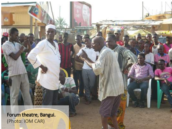
Forum theatre, Bangui.

During the reporting period, IOM in coordination with Alliance Francaise of Bangui implemented a theatre campaign that reached several hundred community members in Bangui. Four productions of the play “ Dieu ne dort Pas ” (God Does Not Sleep) aimed to contribute to peaceful coexistence in the 3 rd and 5 th districts of Bangui. The campaign also included a forum theatre, an interactive platform that encourages participation from the audience. A large crowd of nearly 100 people quickly gathered and audience members were selected to participate. The extemporaneous play focused on a displaced man who returns to find his home has been looted by his neighbour. An audience member played the role of a local leader who helps resolve the conflict peacefully between the man and his neighbour. After the play, audience members were invited to discuss the play. Using theatre, the campaign successfully reached hundreds of Central Africans to initiate dialogue on social cohesion.