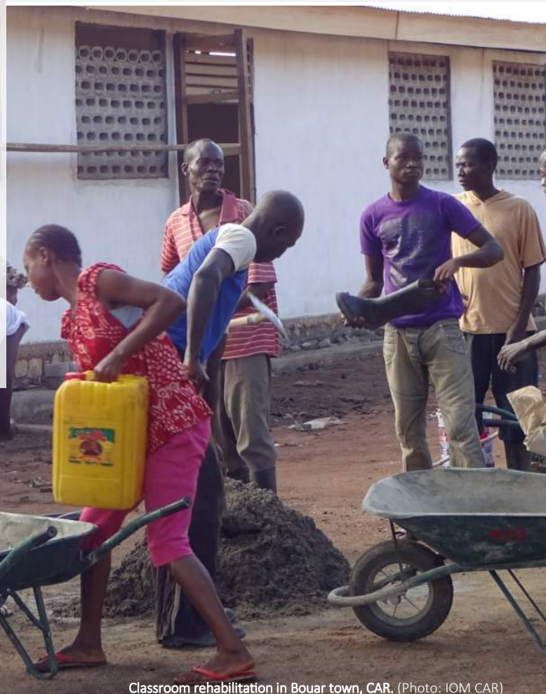
Classroom rehabilitation in Bouar town, CAR.

CAMEROON: In close coordination with IOM in Senegal, the Government of Cameroon, and the Senegal Embassy in Cameroon, IOM facilitated the evacuation of one Senegalese woman from Garoua Boulai to Dakar on 19 May.