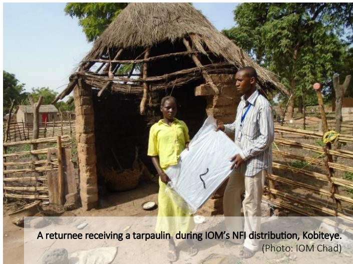
A returnee receiving a tarpaulin during IOM's NFI distribution, Kobiteye.

Moreover, on 19 May, 330 tarpaulins were distributed to the most vulnerable returnees in Kobiteye to enable the repair of their shelters.