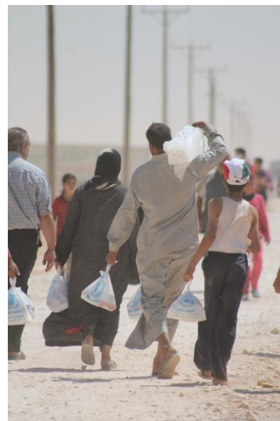
Inside Zaatari Camp

to a guarded safe house in the northern region, raising the total number of defections to 10 Alawite officers and over 3000 Syrian defectors currently residing in Jordan.