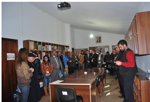
UNHCR and the Danish Refugee Council (DRC) launching the public library in Aidamoun village in Wadi Khaled. © UNHCR – Bathoul Ahmed – February 27 2012