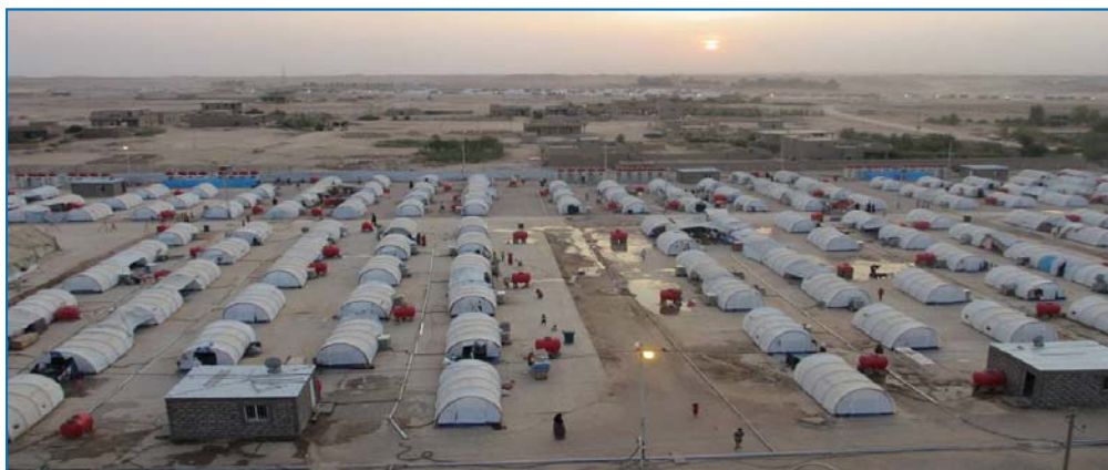
General view of Al Qa'im camp