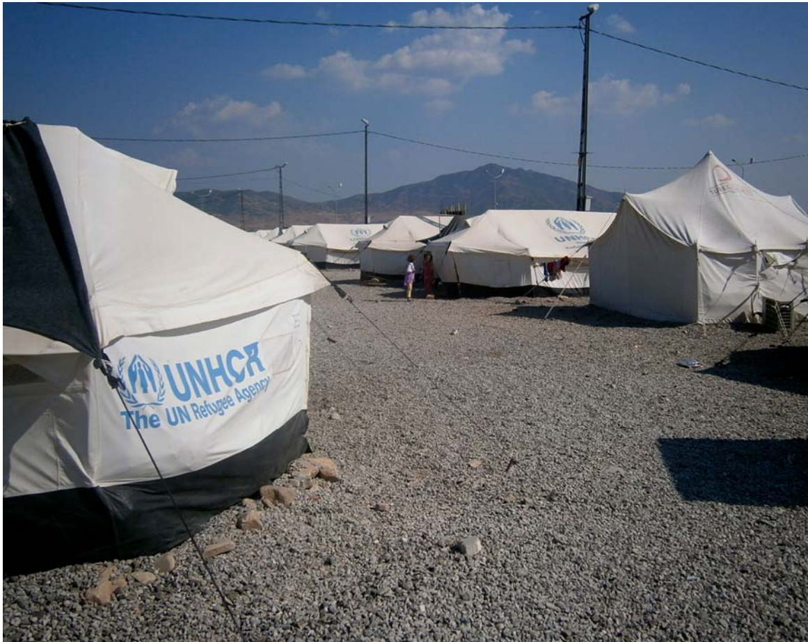
Turkish refugee camp of Kahramanmaraş