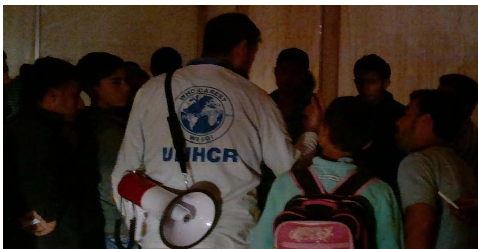
With many refugee arrivals taking place at night, UNHCR has teams working in shifts to welcome and counsel Syrians crossing into Jordan at any time