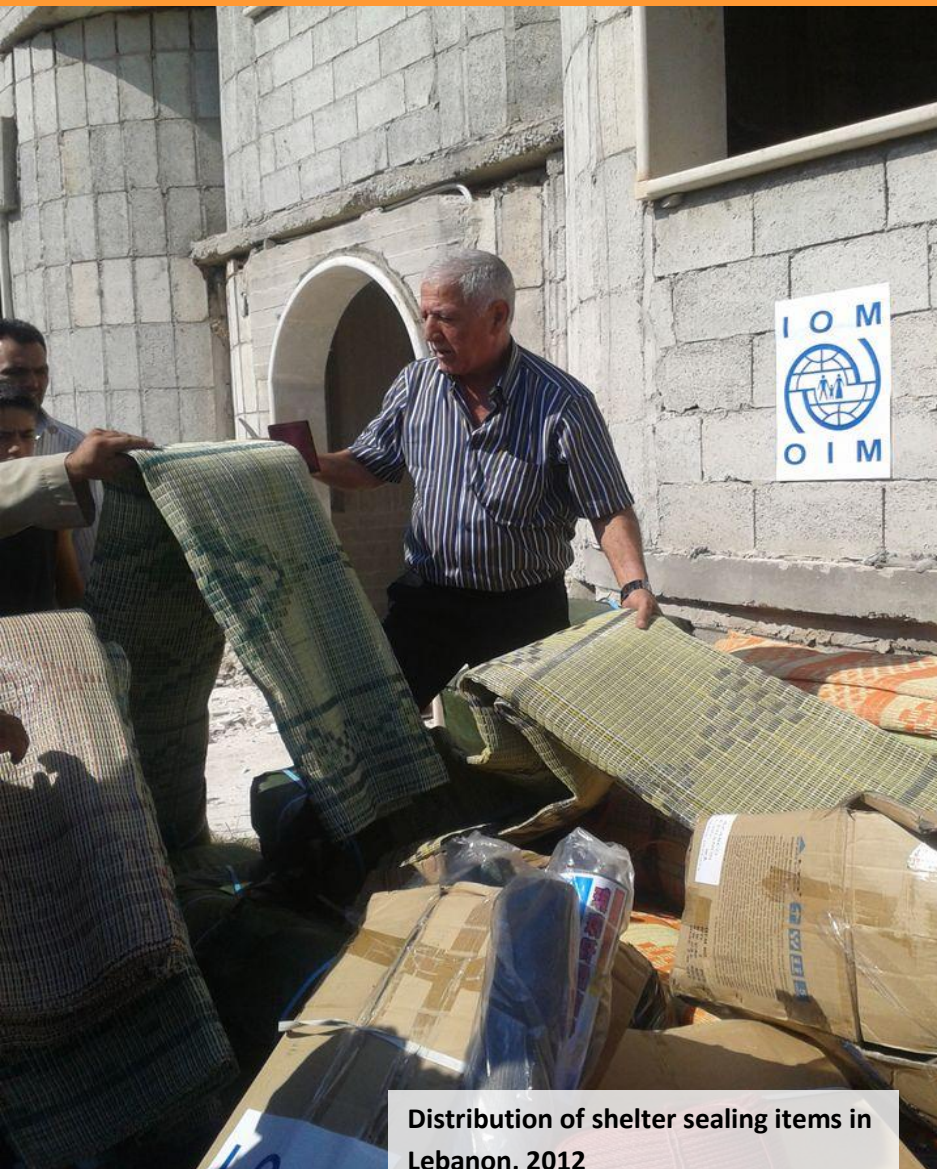
Distribution of shelter sealing items in Lebanon, 2012

This report is produced by the International Organization for Migration (IOM) on its humanitarian response for the crisis in Syria. The summary covers events and activities until 1 November. For activities implemented in Syria, please consult the full situation report.