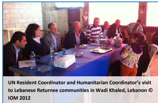
UN Resident Coordinator and Humanitarian Coordinator's visit to Lebanese Returnee communities in Wadi Khaled, Lebanon

On November 21, IOM staff accompanied the UN Resident Coordinator and Humanitarian Coordinator to Lebanon, on a field visit to the Wadi Khaled area to examine the impact of the Syria crisis on the Lebanese communities. As part of the field visit, IOM organized a focus group for Lebanese returnees to express their issues and concerns to the UN Resident Coordinator and Humanitarian Coordinator, who welcomed the commitment and efforts of the Lebanese authorities and IOM to address the ever increasing needs of Lebanese returnees and host communities.