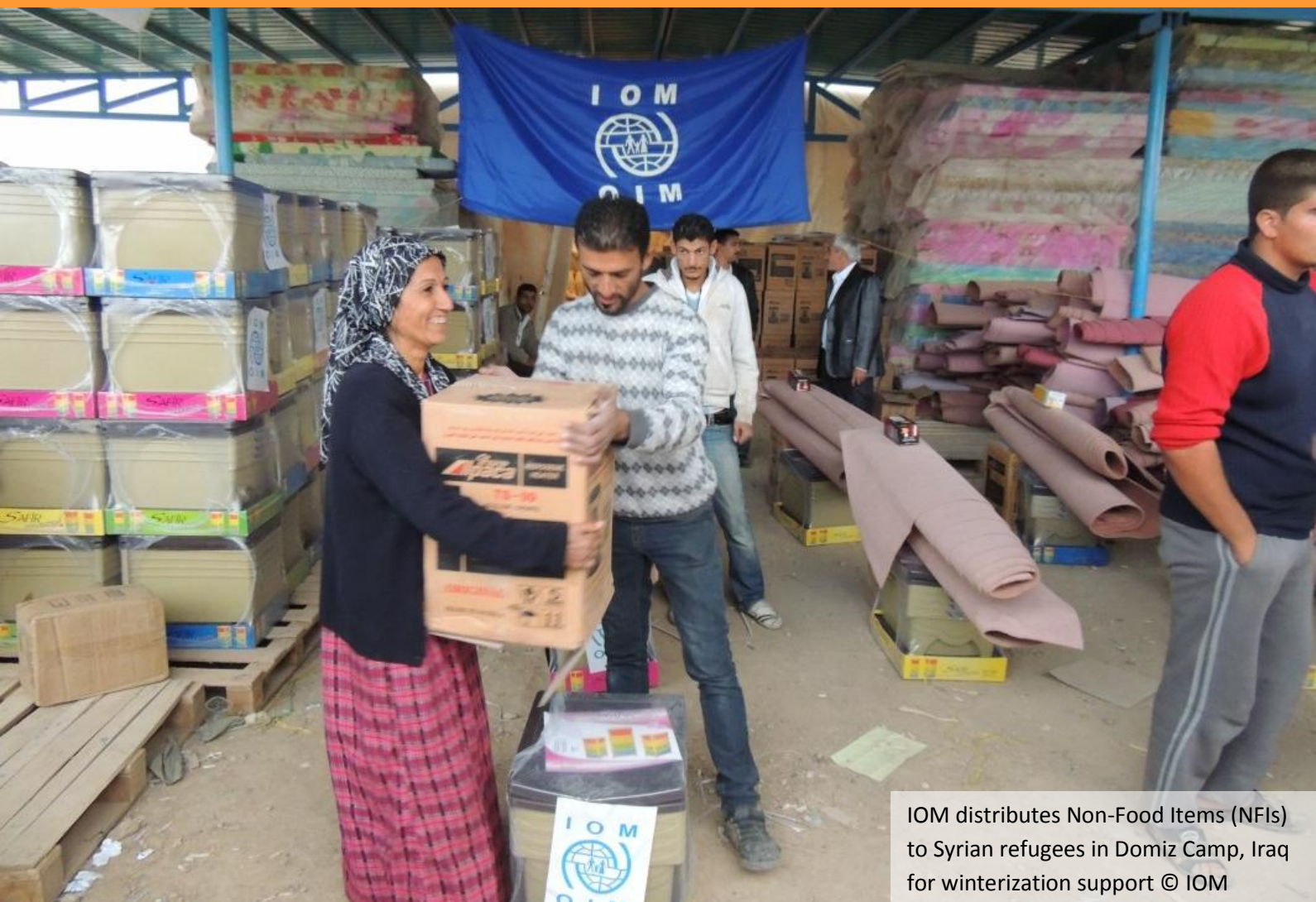
IOM distributes Non-Food Items (NFIs) to Syrian refugees in Domiz Camp, Iraq for winterization support

This report is produced by the International Organization for Migration (IOM) on its humanitarian response for the crisis in Syria. The summary covers events and activities until 22 November. For activities implemented in Syria, please consult the full situation report.