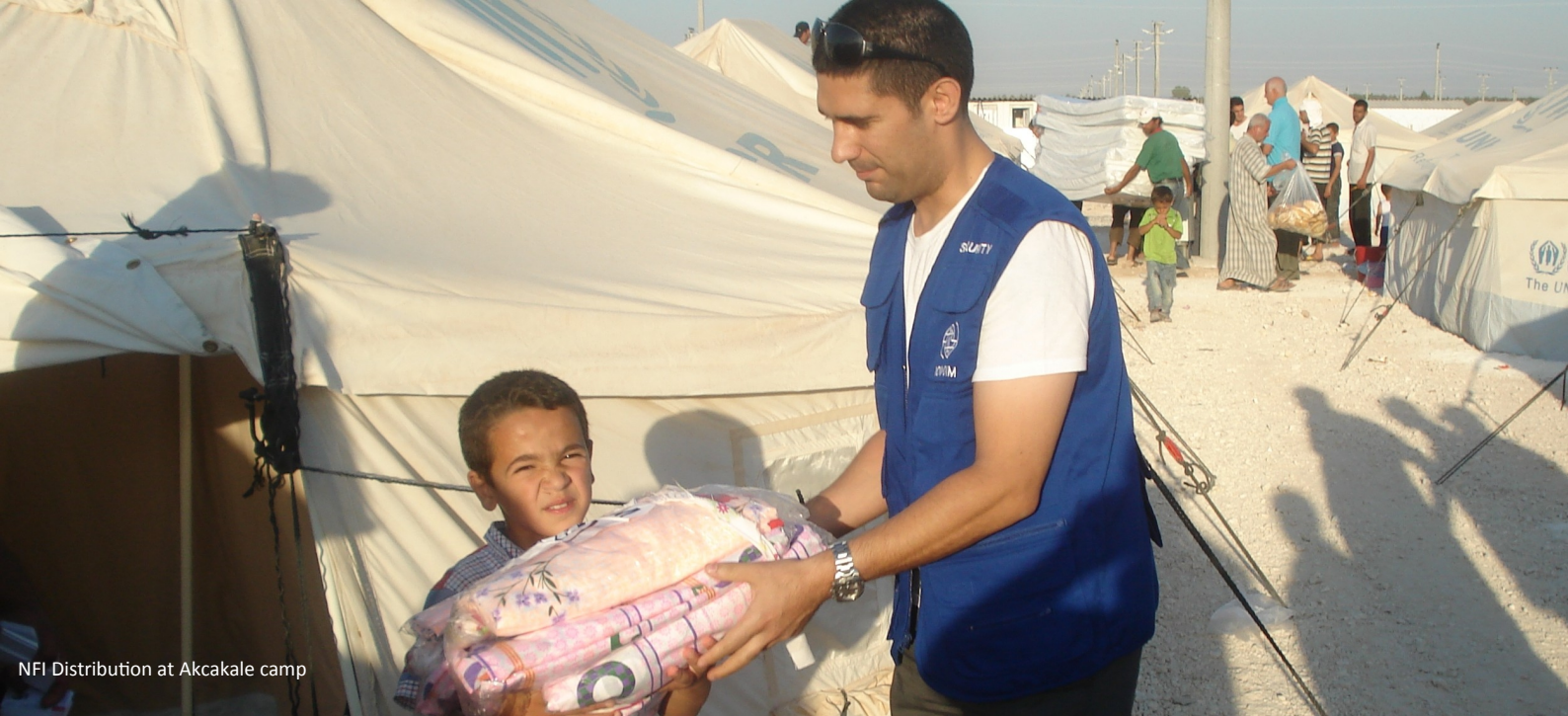
NFI Distribution at Akcakale camp