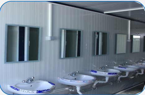
WC container at Karkamish camp