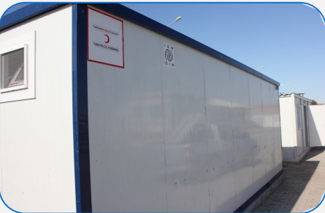
Shower containers at Karkamish camp