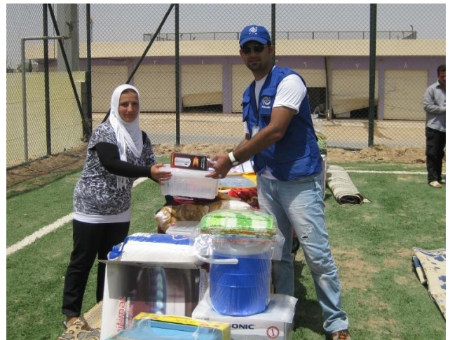
A Syrian refugee receives an NFI kit in Erbil. Since the start of the crisis IOM has provided NFIs to 28,815 beneficiaries.

"Before this support from IOM, my family slept on the carpet and lacked simple necessities. Now, we sleep on mattresses and take comfort in these basic items. My family and I are very appreciative of IOM's help." - Testimony from a Syrian beneficiary from last week's NFI distributions in Sulaymaniyah.