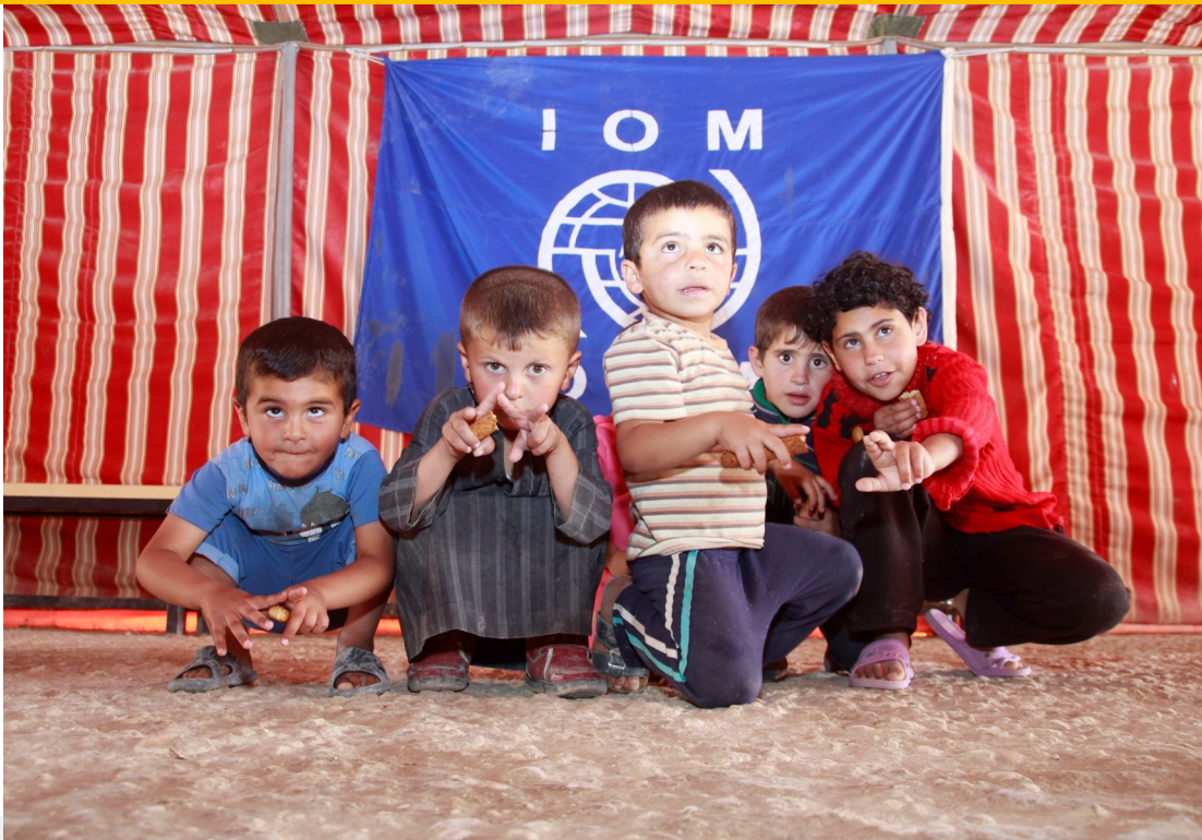
Young refugee children in the IOM reception center at Za'atri Camp while their parents register for assistance.

For activities implemented in Syria, please consult the full situation report.