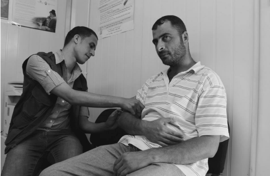
IOM has expanded its health activities in Jordan to include the immunization of newly arrived refugees.

Tuberculosis (TB) Diagnosis and Prevention Activities: An IOM team works daily within the camp to investigate suspected TB cases and to provide follow-up and direct observation of treatment. During the past week, IOM's medical team in Za'atri camp confirmed four new TB cases and is providing follow-up treatment for these cases. Since March 2012, IOM has treated 56 cases of TB, screened 286,471 Syrians for TB and provided TB awareness-raising activities to 85,835 Syrians in the camp, transit centres, and host communities in Jordan.