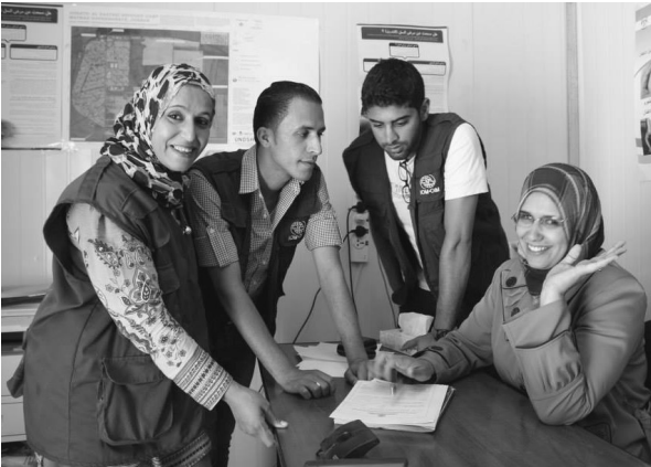
Above - The medical team plan TB awareness-raising sessions at Za'atri Camp. To date IOM has screened over 280,000 Syrians for TB and raised awareness amongst over 88,000 beneficiaries.

gees in Za'atri camp. To date, IOM has facilitated the transportation of 318,165 Syrians from border areas (Thnebe) to Za'atri and EJC camps.