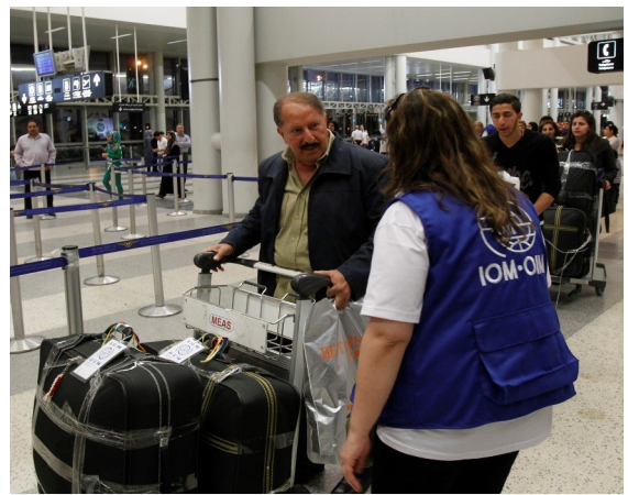
Above - IOM staff assisting a refugee transiting through Rafic Hariri International Airport for resettlement. IOM has provided transit assistance to over 2,000 refugees.

Transit and Resettlement Assistance: During the reporting period IOM provided assistance to 129 refugees who were accepted for resettlement, to transit through Lebanon. The caseload included 65 female and 64 male refugees ( 30 of whom were children). IOM provided the refugees with medical escorts for those who require regular monitoring as they have chronic diseases such as severe hypertension, diabetes, heart palpitations. Since February 2013, IOM has provided transit assistance to 2,877 refugees leaving Syria.