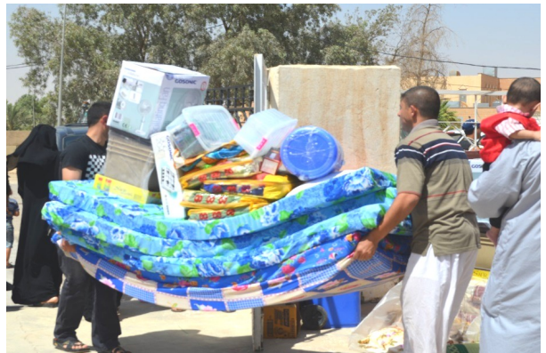
Above - Syrian refugees living in Al Qaim were provided with NFIs. The kits include mattresses, pillows, hygiene items, rechargeable fans and lights, a gas cooker and jerry cans.

Vulnerability Assessments: From 10 to 13 June, IOM conducted vulnerability assessments of 19 Syrian refugee families ( 123 individuals) in Ninewa governorate (Mosul City) in coordination with local council and community leaders. These assessments will identify the most vulnerable families who are eligible to receive NFI assistance. Key findings include: