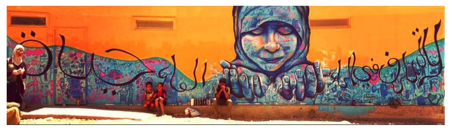
A mural depicting the water conservation message, 'Don't waste water, water is life' in Za'atri camp, Jordan.

<u>Jordan</u> - ACTED is currently working in partnership in Za'atri camp with AptART, an NGO aiming to promote awareness and prevention of issues affecting vulnerable children's lives through engaging them in art, with the support of UNICEF. ACTED and AptART are collaboratively painting murals around the camp to address hygiene-related issues such as water conservation, hand-washing, the importance of disease prevention, and the link between knowledge and health, as well as encouraging ownership over shared public spaces. ACTED is working on expanding the AptART project implemented in Jordan into Iraq.