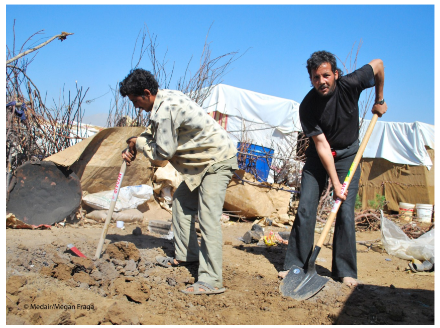
Syrian refugees constructing dry wells to improve the drainage and sanitation in informal tented settlements in the Bekaa Valley, Lebanon.

• Lebanon - Medair has been a lead agency in the Central and West Bekaa Valley in providing shelter assistance to informal refugee settlements. Activities include distributing shelter kits and conducting site improvement activities. Shelter kits include vinyl, nails, wood planks, and plastic sheeting to assist refugees in constructing sturdier, more weather-resistant tents. Medair is also conducting site improvements in 40 settlements in the Central and West Bekaa. The sites are not planned and sanitation and drainage issues often arise, creating flooding and public health risks. Medair is designing an improvement plan for these settlements that includes digging drainage ditches and dry wells, planning latrine construction and implementing waste management plans. Medair will also map out all informal settlements in the Central and West Bekaa using GIS mapping. Maps and datasheets will be shared with UNHCR and other