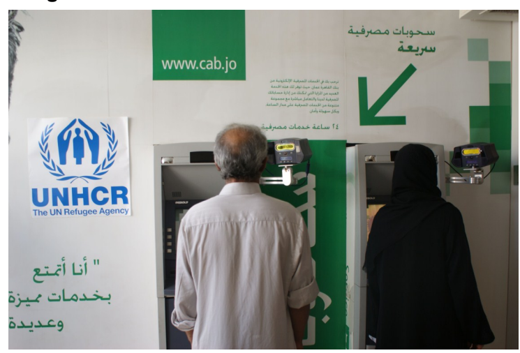
Iris scan technology being used by refugees to access their financial assistance at an ATM.