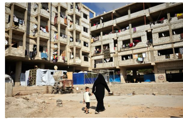
Syrian refugees in front of collective accommodation in the South