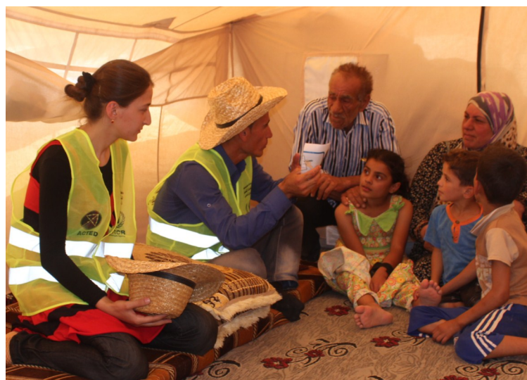
Outreach workers informing a newly arrived family and distributing brochures.