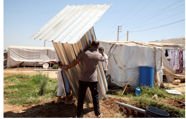
Construction of a latrine in an informal settlement in the Bekaa

the existing water supply in some locations has created a source of tension between refugees and host communities. The current amount of water trucking is considered sustainable under existing supplies. UNHCR continues to monitor the situation closely, and will determine if intervention is needed.