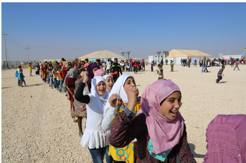
On Universal Children's Day, 20 November, approximately 600 children gathered at one of the 37 Child Friendly Spaces in Za'atri camp.

The regional response for refugees fleeing Syria is the coordinated effort of 126 participating organizations, including 84 appealing: