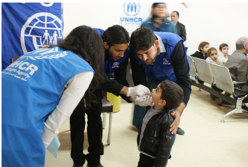
MOH, IOM and UNHCR in Khalda Registration Centre, Amman, where on average 150 children and youth are vaccinated daily.