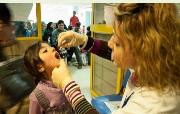
A young girl is inoculated against measles at a UNHCR registration centre

As a consequence of the violence in Syria and the destruction of public infrastructure, many refugees arrive in Lebanon with health conditions that require immediate attention. Others have developed health problems during displacement related to trauma and substandard living conditions. Common health care needs of refugees include: reproductive health care and family planning, child health care (i.e. vaccinations), treatment for acute illnesses (respiratory infections, gastrointestinal diseases), chronic diseases