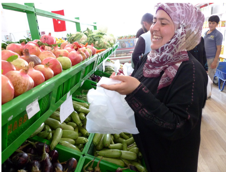
The WFP and Turkish Red Crescent e-food card programme allows refugees to choose from a variety of fresh produce and packaged foodstuffs in to prepare their family's daily meals.