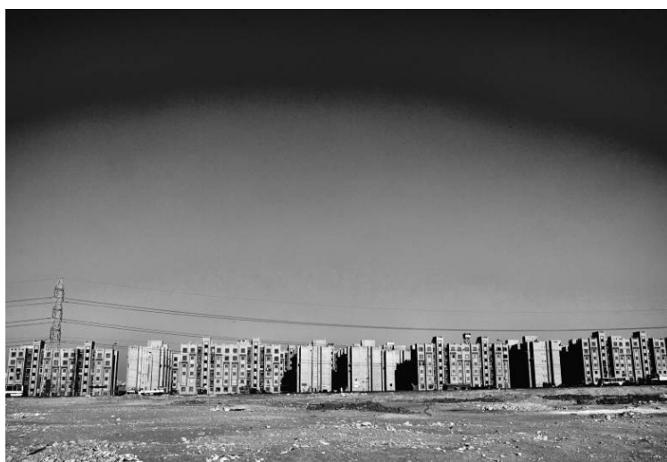
The Masaken Osman neighbourhood of Sixth of October City outside Cairo. The district contains a mix of lower income Egyptian families and hundreds of newly arrived Syrian refugees.