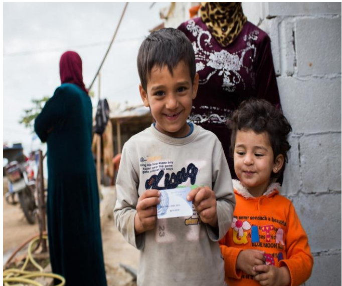
Refugee children holding a new ATM card

Based on the experience from the winterization and other cash programmes, UNHCR is planning a shift in 2014 from sector-specific or 'conditional' cash assistance to a more comprehensive 'unconditional' strategy to administer monthly cash grants. The approach seeks to target the most vulnerable among refugees. The refugee population at large will continue to benefit from protection services, food, health and education and other ad hoc emergency interventions. In this way, cash assistance via ATM will supplement, rather than replace other forms of assistance.