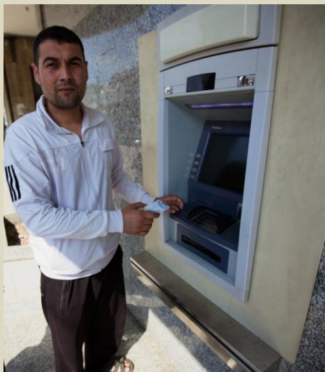
Syrian refugee using an ATM card in Qobayat