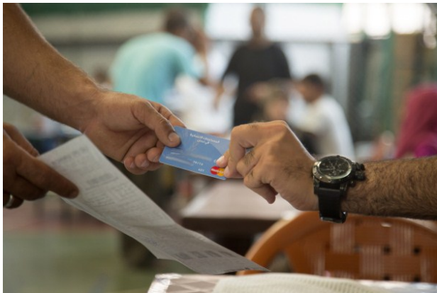
E-card ditribution Nabatiyeh October 2013

There was no change in the estimated number of livestock vaccinated under the FAO/MoA spearheaded livestock vaccination programme. So far, more than more than 70 percent of the estimated livestock in Lebanon have been vaccinated. Vulnerable small-scale livestock herders in North Lebanon and Akkar received more than 1,124 MT of concentrated feed has been distributed to vulnerable.