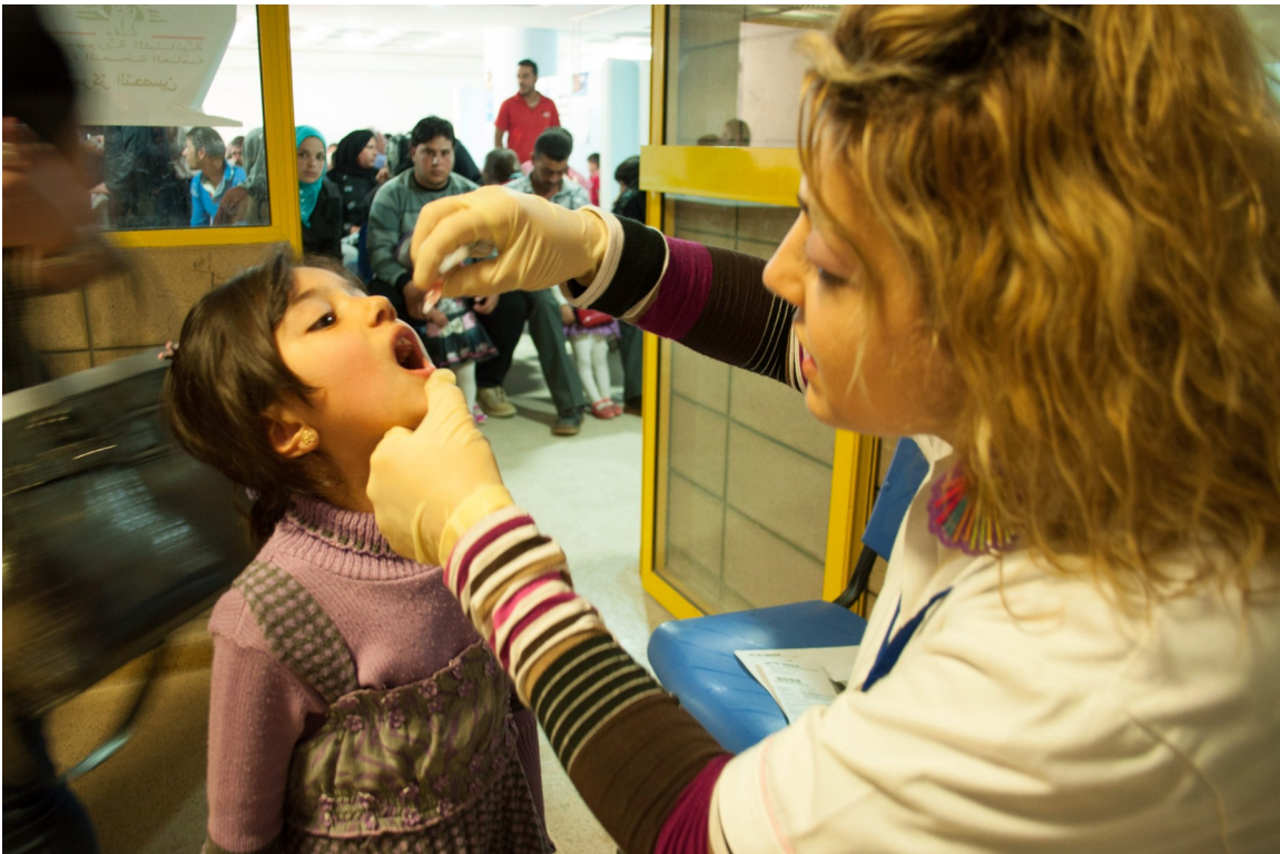
One Syrian Refugee child during the Polio Campaign vaccination in Lebanon

Obstetrics procedures account for the majority of referral healthcare costs and admissions for refugees in Lebanon. Of the obstetric admissions the main reason was for deliveries with approximately one third requiring cesarean sections. The second highest referral costs have been for neonatal and congenital conditions. Therefore, women and children comprise the largest number of users of referral care. Referral healthcare is extremely expensive in Lebanon and the health budget required for 1.5 million refugees remains extremely underfunded. Difficult decisions on prioritizing referral care are made everyday to ensure health resources are used for emergency and life saving procedures with good prognoses.