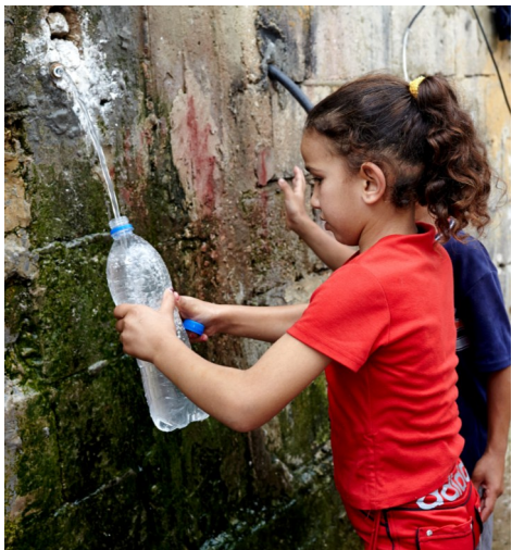
Refugee children collecting water at a water point established by WASH partners in Lebanon