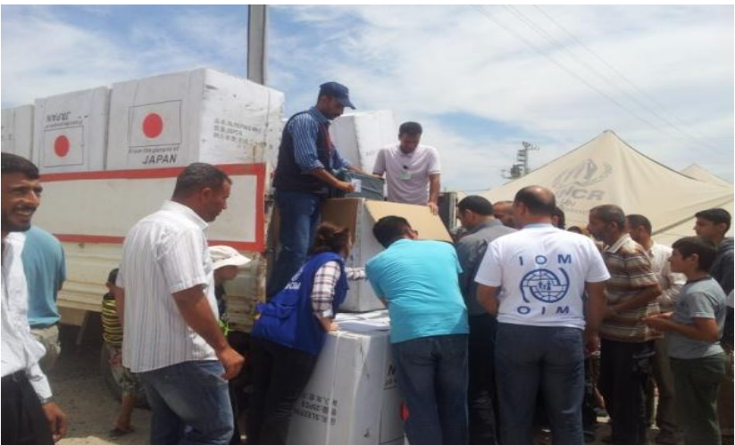
Provision of NFI to Syrians in Viransehir camp-Sanliurfa

Over 2000 vulnerable families, with a total of 11,371 individuals, were supported by IOM with electronic cards allowing them to purchase food and hygiene items in the town and villages of Reyhanli and Kirikhan in Hatay province.