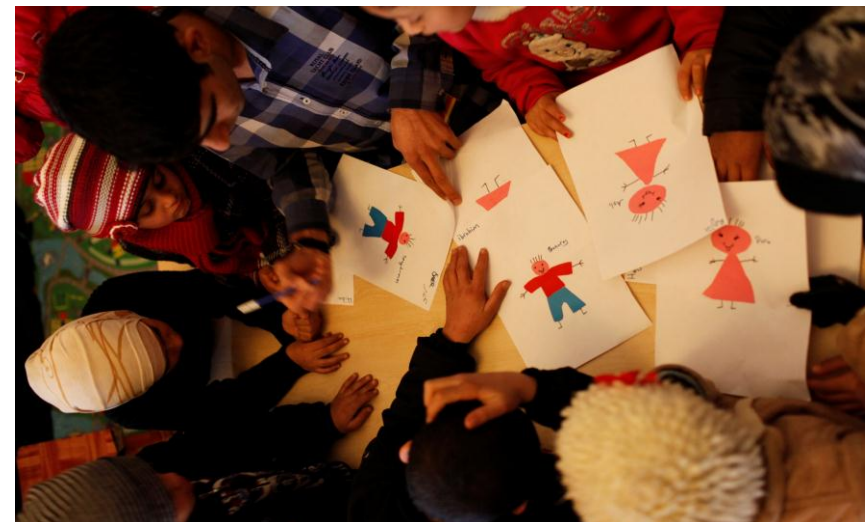
Refugee children drawing pictures, Sanliurfa

Participating Agencies: UNICEF, UNHCR, IOM