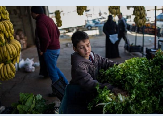
Syrian Refugees boy, sorts vegetables at a groceries store in Bebnine, Akkar