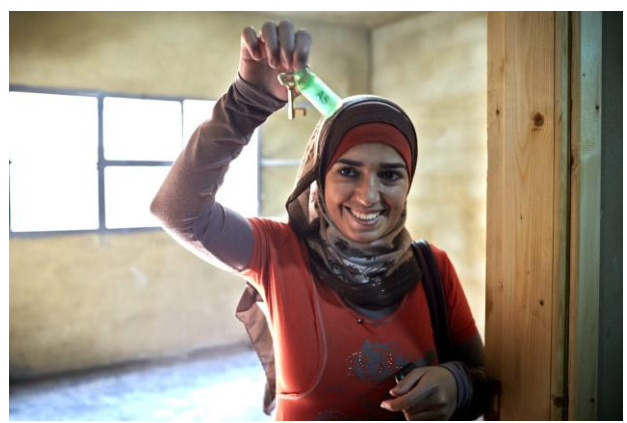
Syrian refugee showing the key to her room at a new collective shelter in Kherbet Dawood in northern Lebanon.