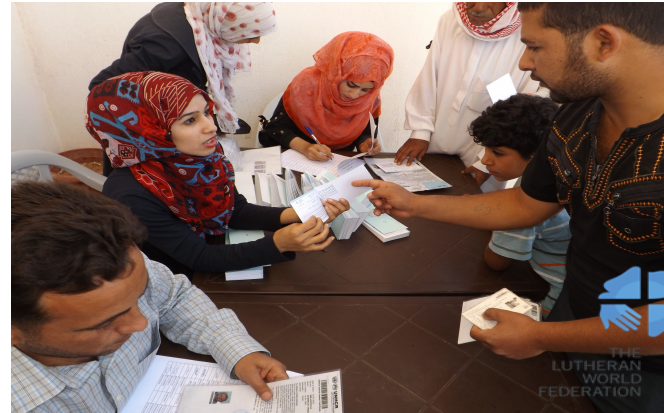
LWF complementary food vouchers distribution.