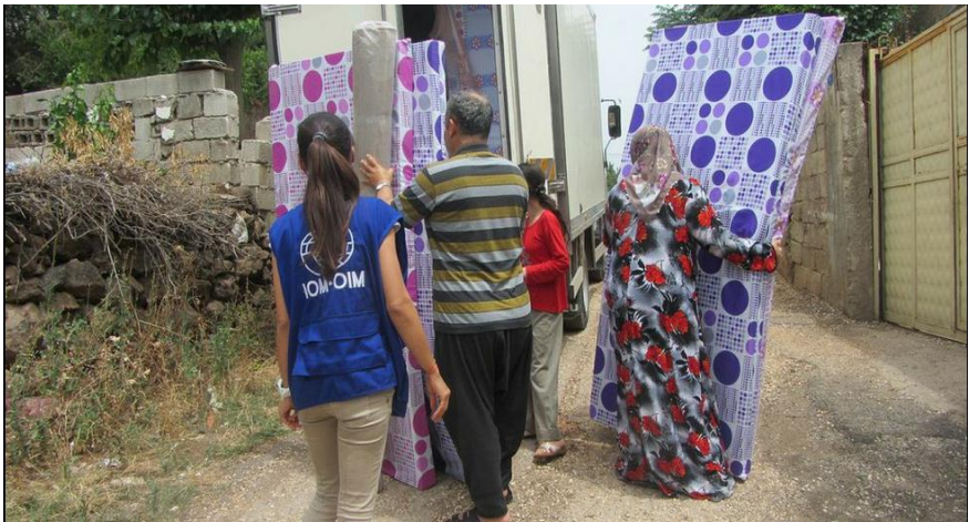
Provision of NFIs to Syrians in Hatay province

During the reporting period, IOM has also continued to provide emergency non-food items for the Syrians living in Hatay province. The IOM field team assisted 393 families (2010 persons) through the provision of mattresses, carpets, bed linens, pillows and diapers for children.