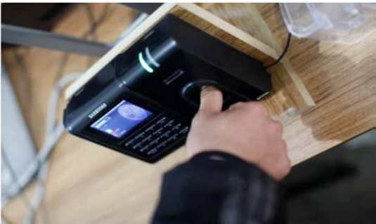
Finger printing , during registration procedures - Midyat-Mardin Camp, Turkey.