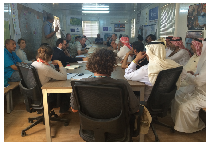
WASH partners meet with Zaatari camp community leaders to discuss the water distribution system in the camp.