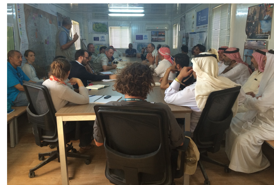
WASH partners meet with Zaatari camp community leaders to discuss the water distribution system in the camp.