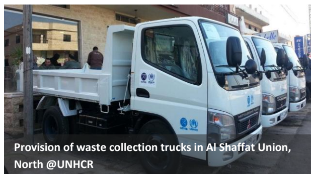
Provision of waste collection trucks in Al Shaffat Union, North

CSPs involve active participation from the community to ensure that they are in line with community priorities. So far, a total of USD 42.7 million has been allocated in 2014 for both institutional support and CSPs.