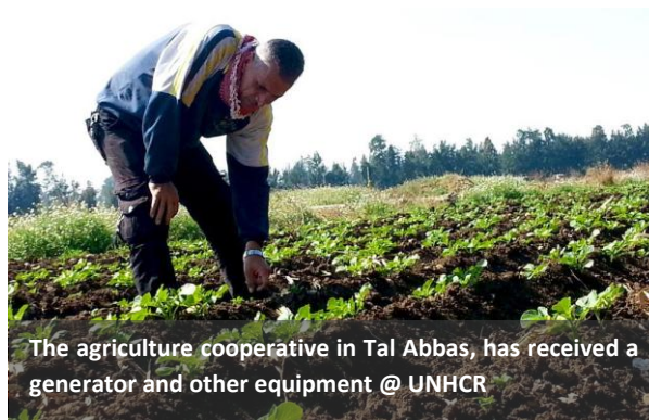
The agriculture cooperative in Tal Abbas, has received a generator and other equipment

The Lebanese population has made tremendous efforts to host and cater for the needs of Syrian refugees over the last three years. Currently, over one million registered Syrian refugees are living in more than 1,750 locations, and some towns have more refugees than resident Lebanese. Host communities require institutional and capacity support to manage larger numbers of residents.